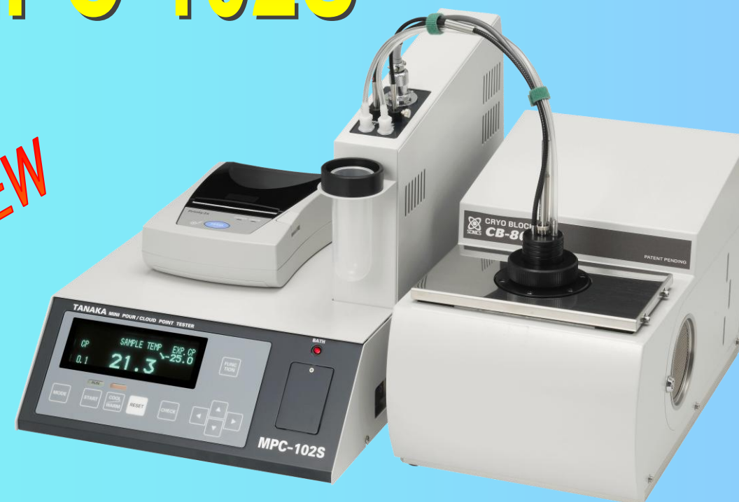
MPC-102S with optional printer "BS2-80TS"