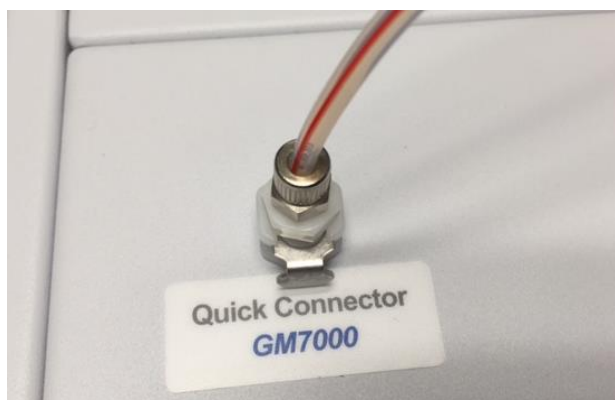
Figure 1. Quick connector on left top side TSHR 7000 series for GM 7000 connection

The content of this package, which is having P/N (70001055) is: