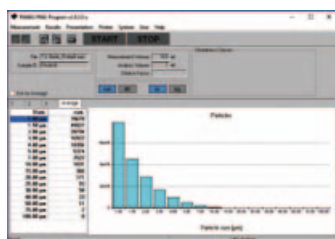
User interface of PAMAS PMA software